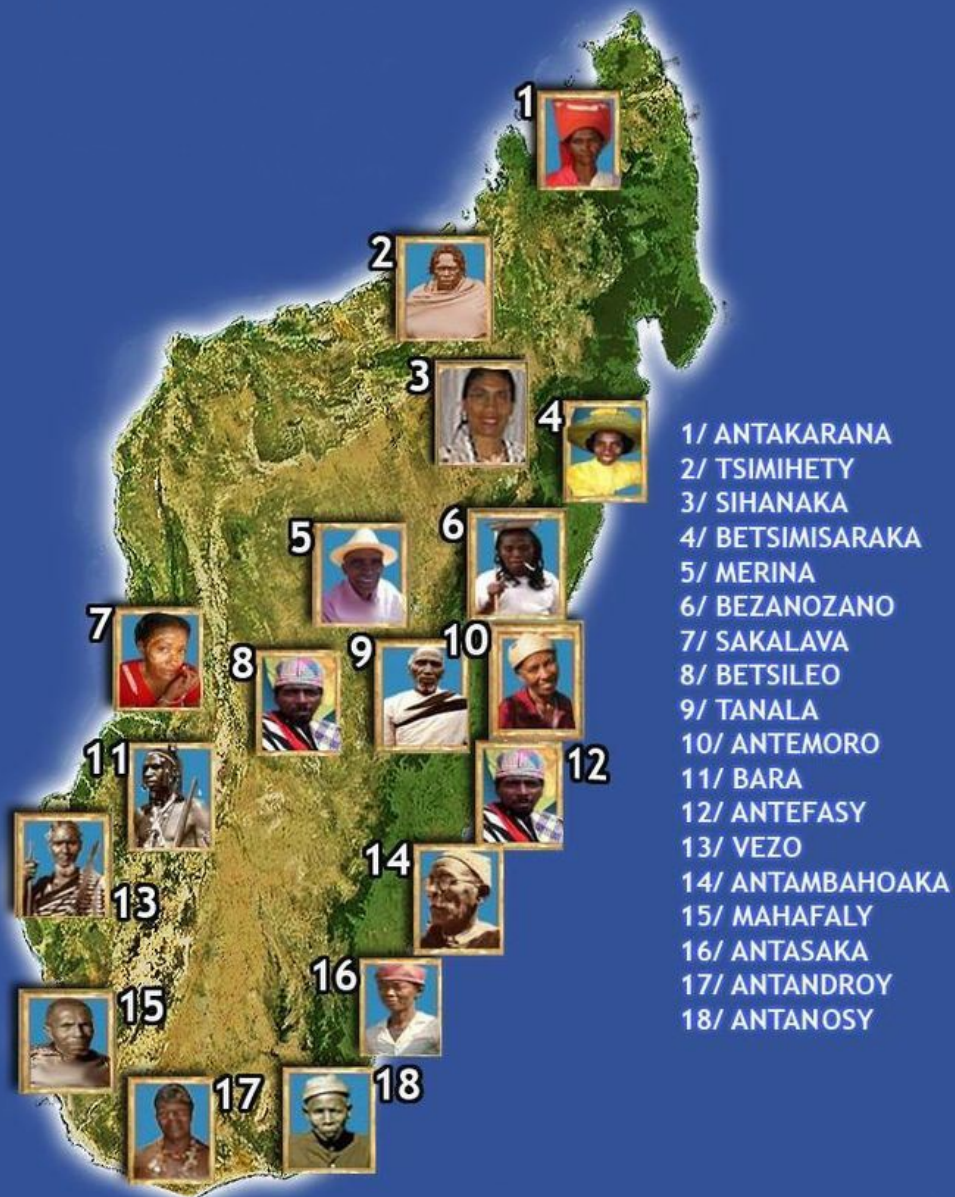
The population and the 18 ethnic groups of Madagascar